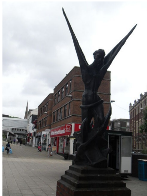
Statue of the Phoenix in Bull Yard. The cathedral spire is visible in the background