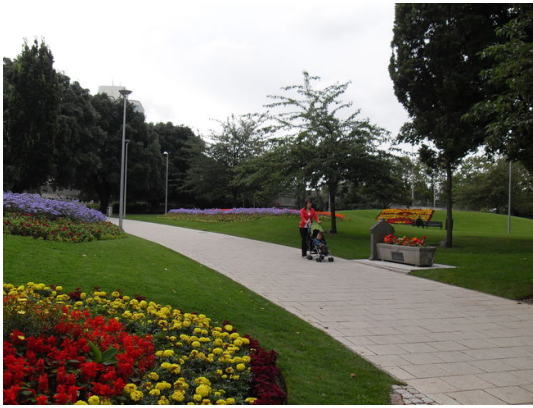
Greyfriars Green, well refurbished in 2012