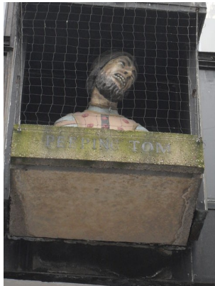
Peeping Tom looks down over Hertford Street