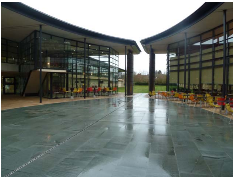
Network Rail Training College, Westwood Heath

The area remained predominantly agricultural until the end of the 20 th Century/beginning of the 21 st Century when a business park and residential development were built on much of the farmland. With the exception of a water course, which is the boundary of the northern edge of the business park, none of the development reflects the former field patterns.