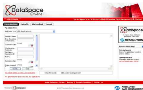
DataSpace On-line Screenshot

Why not give it a try, once registered you can even make a test application.