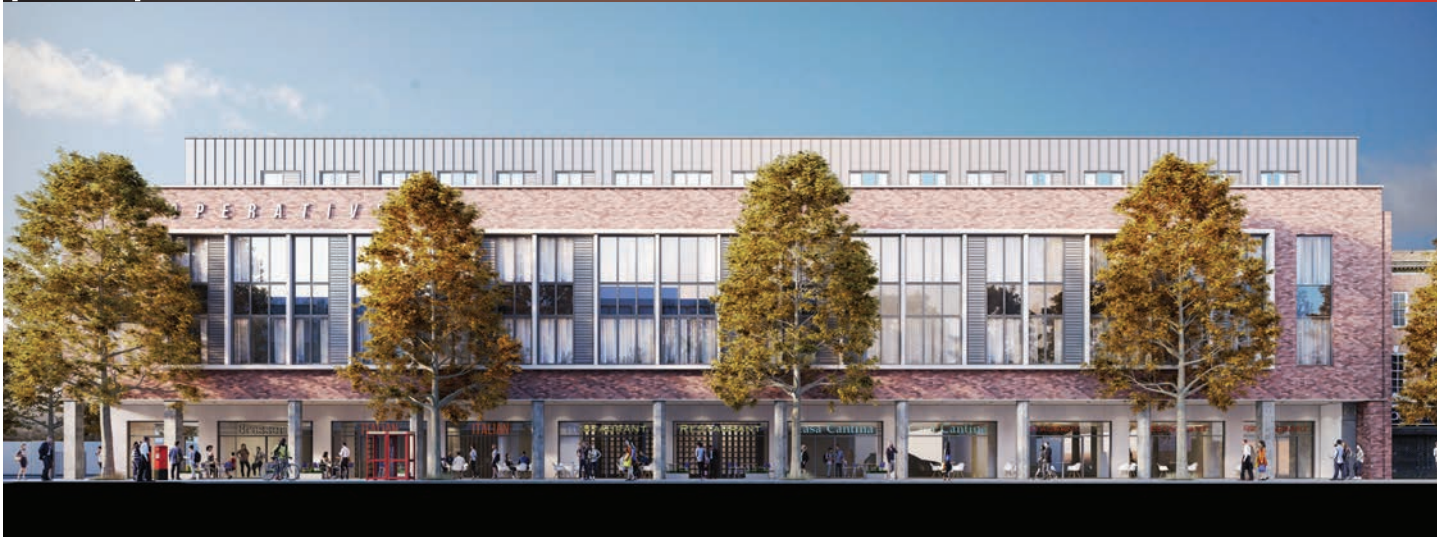
■ Artists impression of the Co-Operative building.