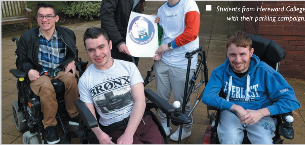
Students from Hereward College with their parking campaign.

Poster entries must highlight the problem of cars parked on pavements and be saved as a jpeg or hi-res pdf file (A3). Email entries to hppc.coventry@gmail.com by Friday 23 March. They will be judged in three categories, Under 12s, 13 -18, and 18+. Winners will be announced on 2 April and their posters used at a range of venues across the city.