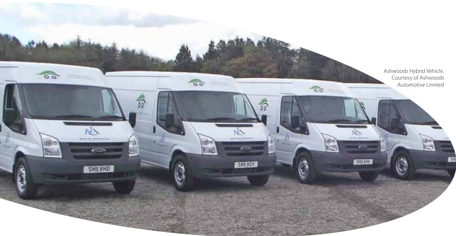
Ashwoods Hybrid Vehicle.