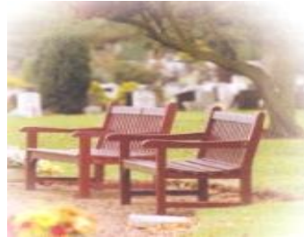
Wooden Memorial Seats

Office Opening Hours Mon – Friday 9.00am – 4.00pm