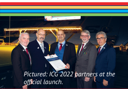
Pictured: ICG 2022 partners at the official launch.

Coventry will host judo, rugby sevens and wrestling at Coventry Arena during the Birmingham 2022 Commonwealth Games from 28 July to 8 August 2022 in addition to a community arts festival in the city.