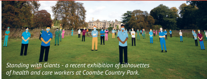
Standing with Giants - a recent exhibition of silhouettes of health and care workers at Coombe Country Park.

There are also many examples of innovation applied across services, from transport to building, and housing to care. This helps us manage the Council's finances in the most effective way possible – exactly as you would expect.