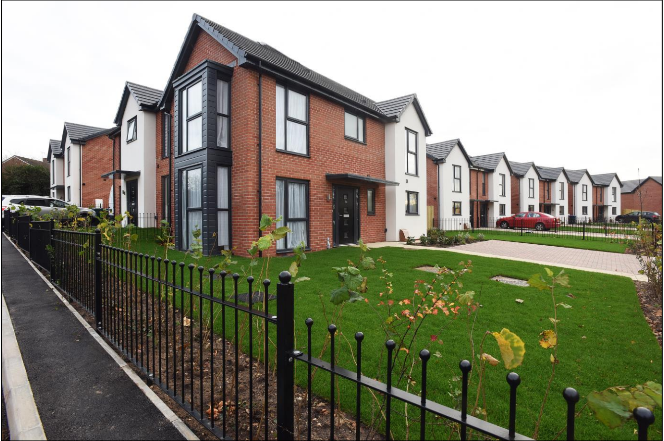
Example of Affordable Housing at Stretton Avenue, Coventry

and maintains social integration and cohesiveness.