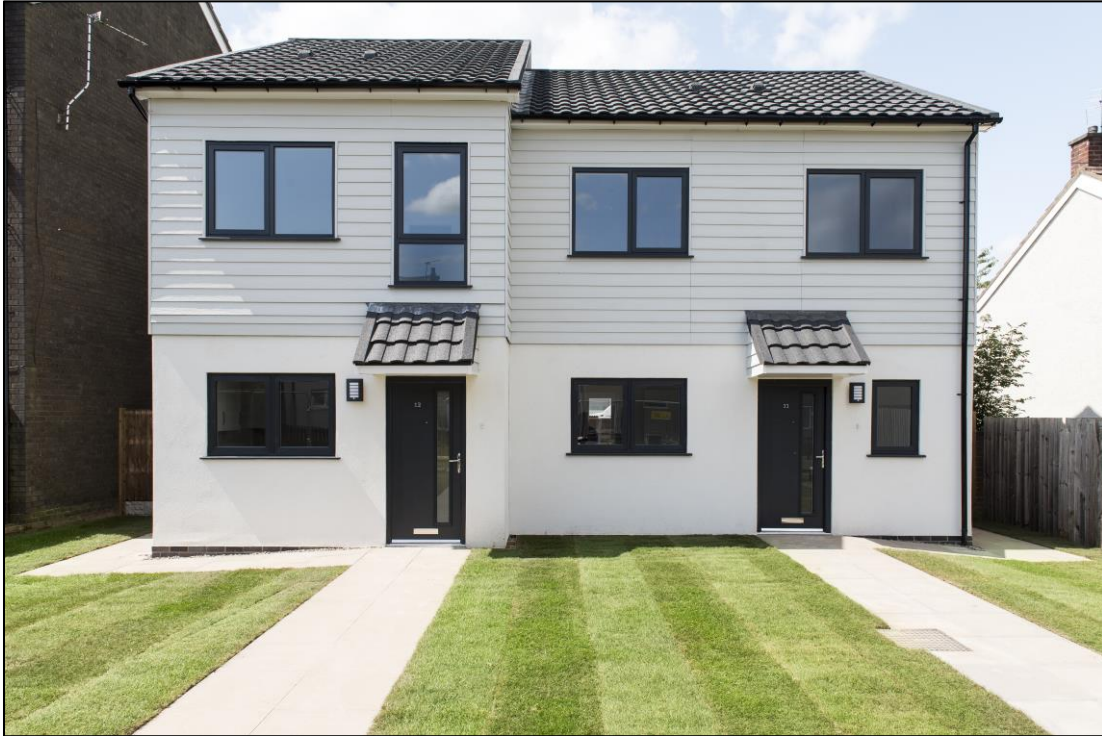
Modular housing delivered at Littlethorpe, Coventry by Citizen Housing

5.26 Affordable housing products are also being delivered via AMC within the wider West Midlands metropolitan area. Birmingham Municipal Housing Trust have initiated a programme in delivering affordable homes utilising modular methods that achieve a high level of sustainability and cost effectiveness that delivers homes of good quality, quickly.