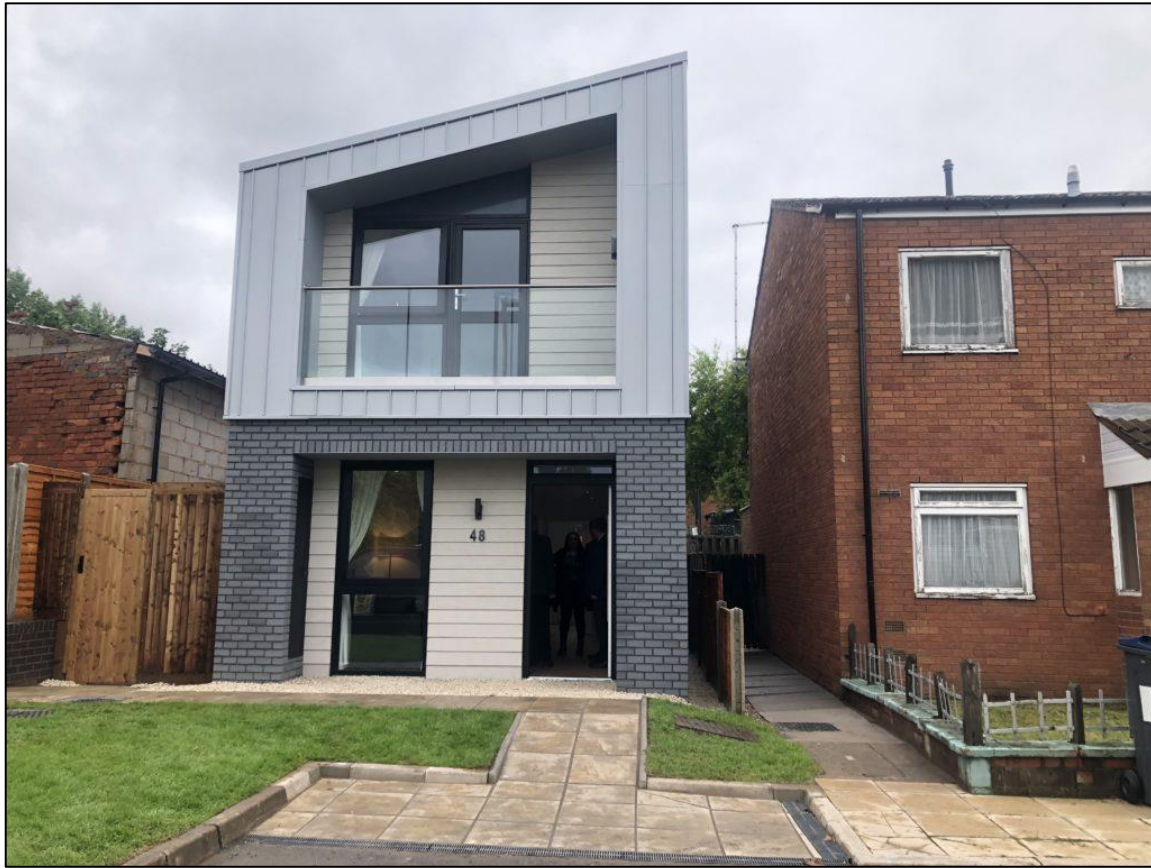
Modular affordable home delivered in Birmingham

5.27 Coventry City Council will encourage proposals to deliver affordable homes via Advanced Methods of Construction, particularly in cases where it can overcome viability issues and contribute towards achieving high performing, energy-efficient homes.