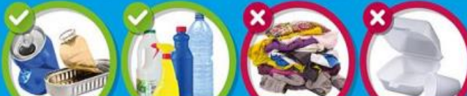
Food and drinks cans Plastic bottles Clothes and bedding Polystyrene