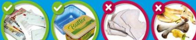
Paper, magazines and card Food tubs Nappies Food waste