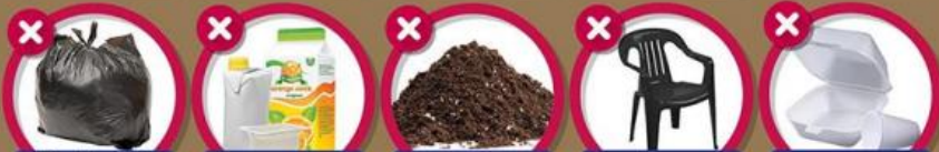
Black bagged waste Food packaging Soil Garden furniture Polystyrene