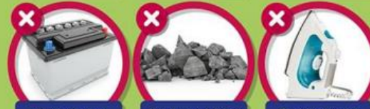
Car batteries Hard core/rubble Electrical items