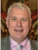
A personal message from Cllr George Duggins, Leader, Coventry City Council.