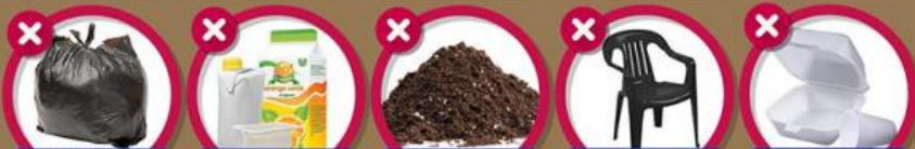
Black bagged waste Food packaging Soil Garden furniture Polystyrene