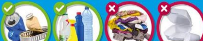
Food and drinks cans Plastic bottles Clothes and bedding Polystyrene