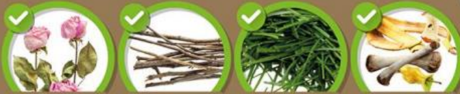
Flowers and weeds Twigs Grass cuttings Food waste