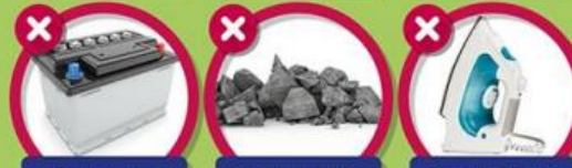
Car batteries Hard core/rubble Electrical items