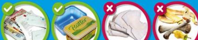
Paper, magazines and card Food tubs Nappies Food waste