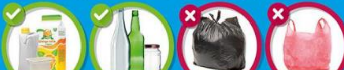
Cartons Glass bottles and jars Black bagged waste Carrier bags