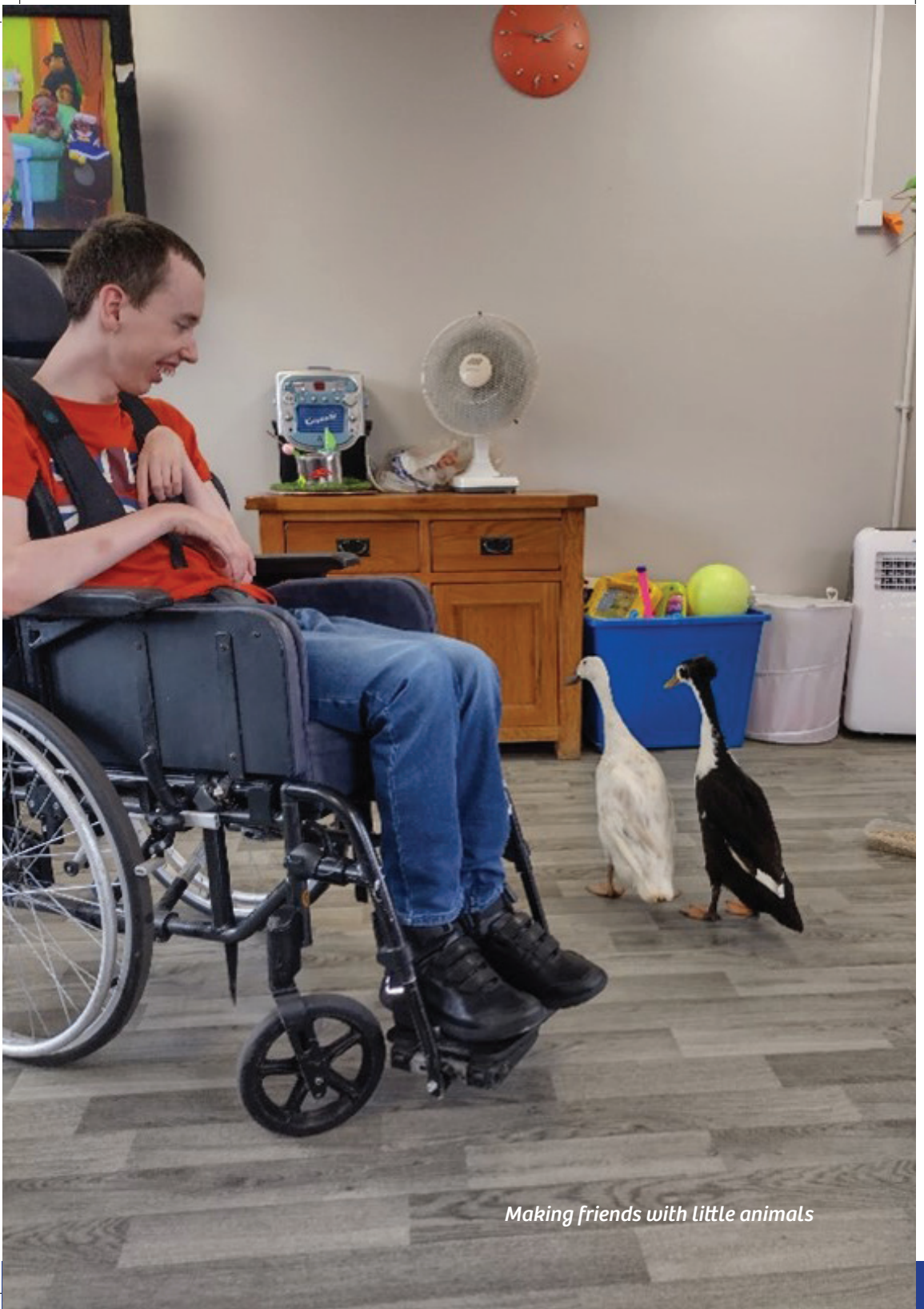
Making friends with little animals