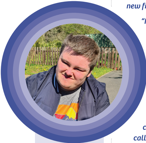
People having fun.

Brandon Wood Farm is open Monday to Friday, 9am to 3pm (except bank holidays).