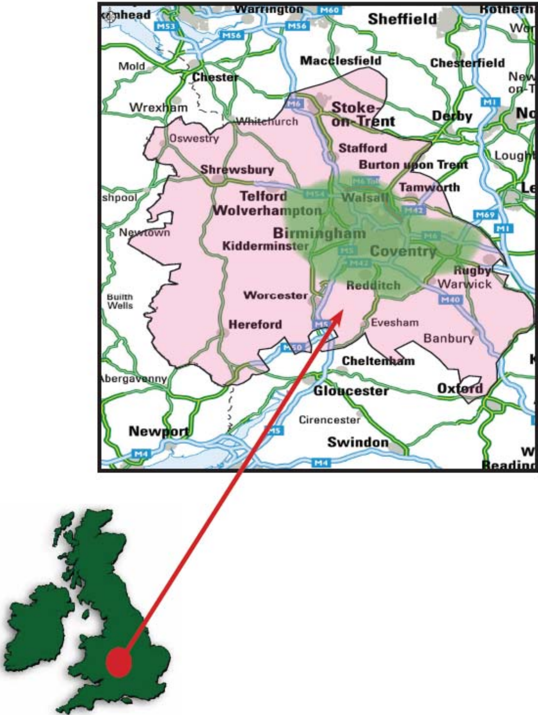
Figure 1: Location of the West Midlands and the West Midlands Metropolitan Green Belt.