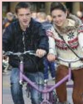
■ Shoppers saddle up on a bicycle made for two.

Coventry City Council has contributed £3.5million of Government funds earmarked for green and sustainable transport projects to kick-start the scheme. The remaining £3.4million comes from Centro's Smart Network, Smarter Choices programme which will deliver £50million of sustainable improvements across the West Midlands over the next three years.