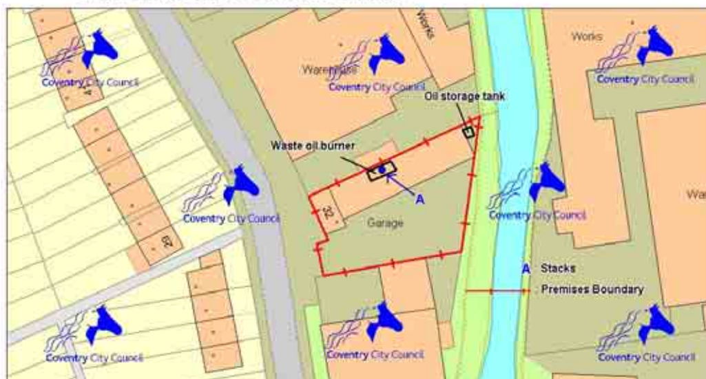
Plan PPC/001/A Premises Boundary of Leek Motors

© Coventry City Council © NERC © Crown copyright. All rights reserved 100026294 (2005) © Landmark Information Group LM00080 & HLU0002 All rights reserved