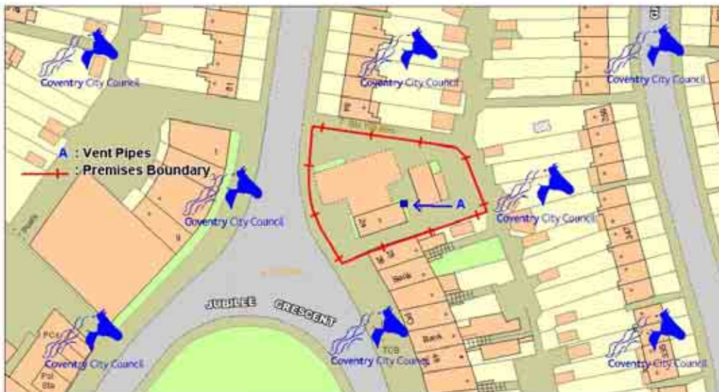
Plan PPC/139/A Radford Service Station