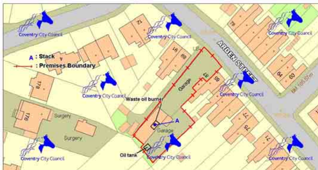
Plan PPC/017/A Premises Boundary of Metro Centre, Earlsdon Garage

© Coventry City Council © NERC © Crown copyright. All rights reserved 100026294 (2005) © Landmark Information Group LM00080 & HLU00002 All rights reserved