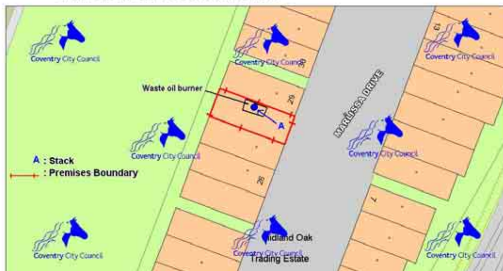
Plan PPC/002/A Premises Boundary of CB Motors

© Coventry City Council © NERC © Crown copyright. All rights reserved 100026294 (2005) © Landmark Information Group LM00080 & HLU0002 All rights reserved